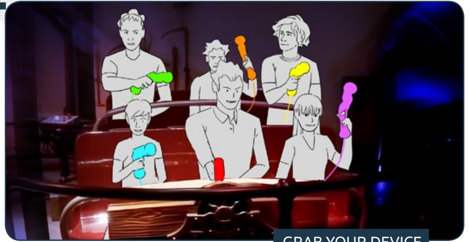
GRAB YOUR DEVICE