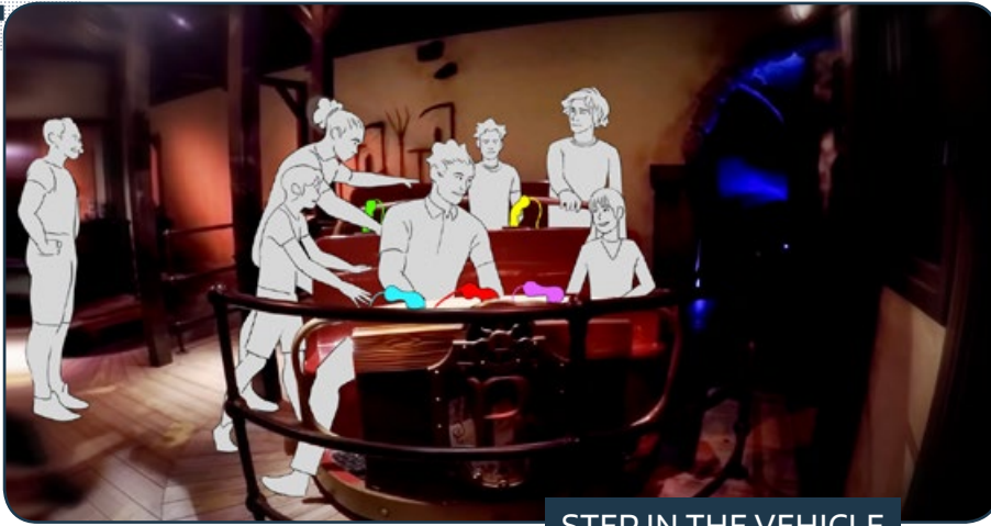
STEP IN THE VEHICLE