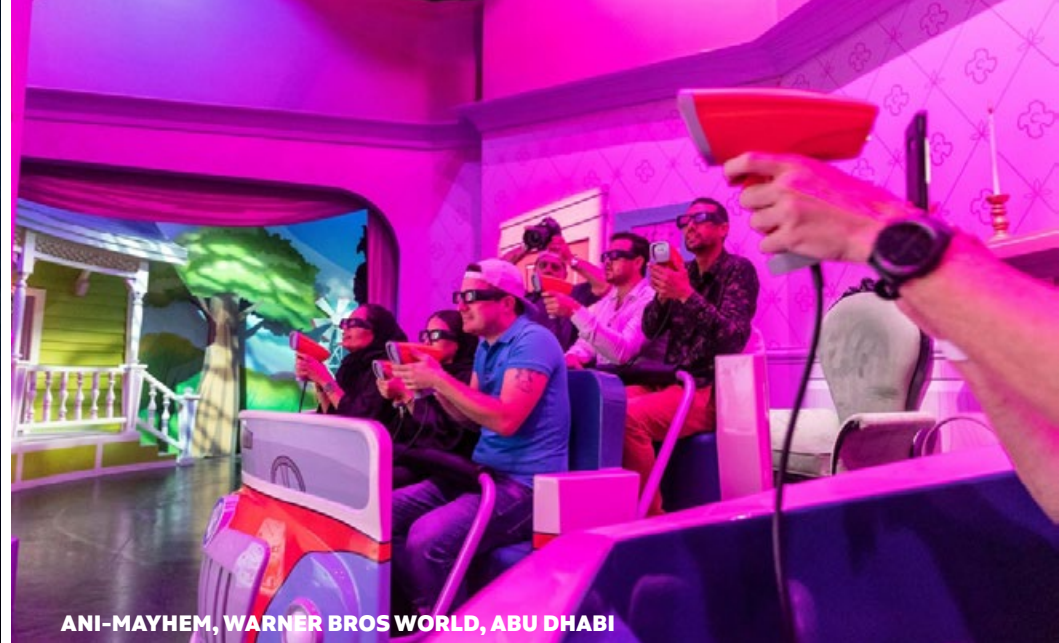
ANI-MAYHEM, WARNER BROS WORLD, ABU DHABI