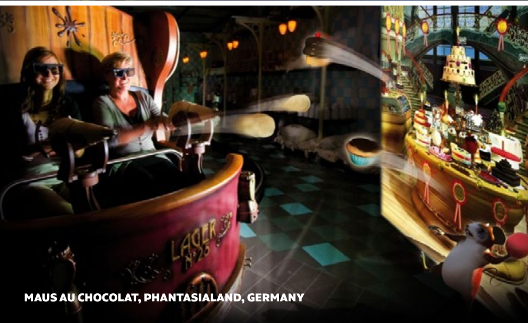
MAUS AU CHOCOLAT, PHANTASIALAND, GERMANY