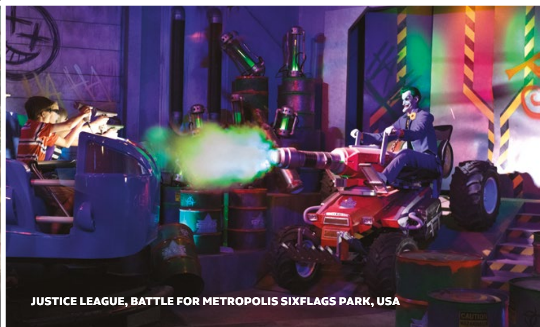
JUSTICE LEAGUE, BATTLE FOR METROPOLIS SIXFLAGS PARK, USA