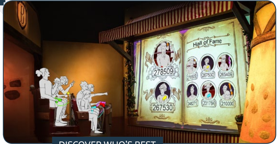
DISCOVER WHO'S BEST