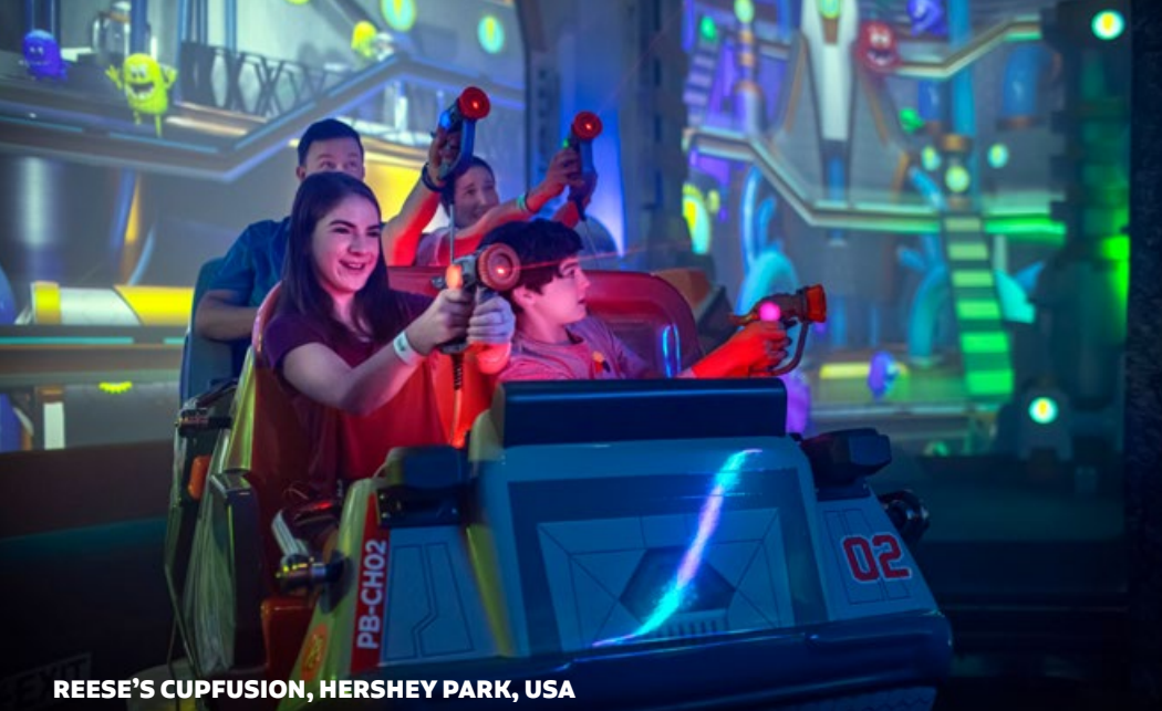
REESE'S CUPFUSION, HERSHEY PARK, USA