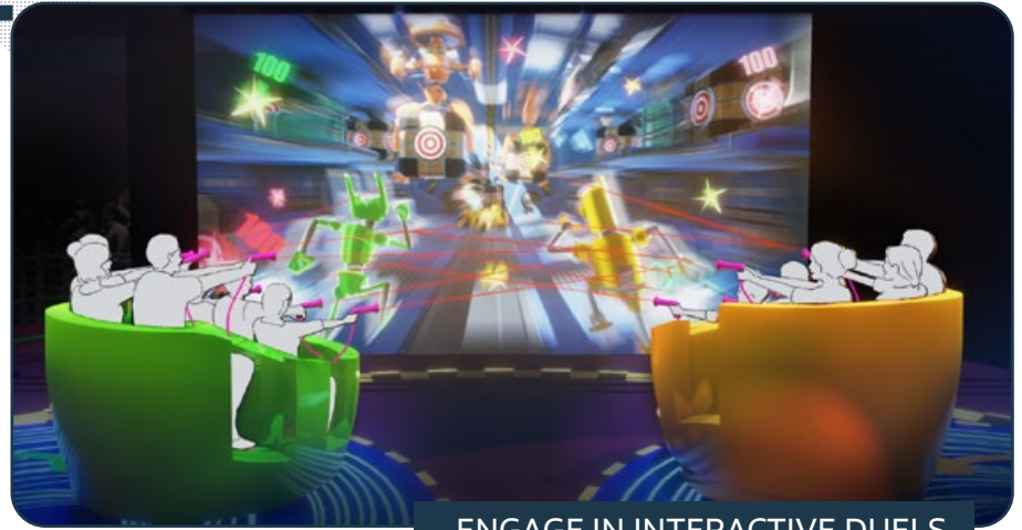
ENGAGE IN INTERACTIVE DUELS