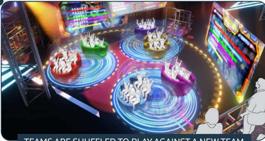
TEAMS ARE SHUFFLED TO PLAY AGAINST A NEW TEAM