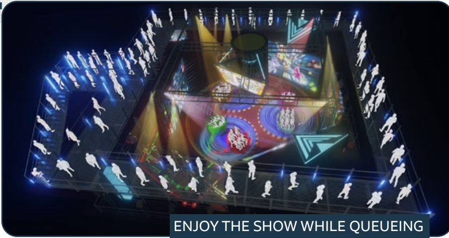
ENJOY THE SHOW WHILE QUEUEING AND TEAMING UP