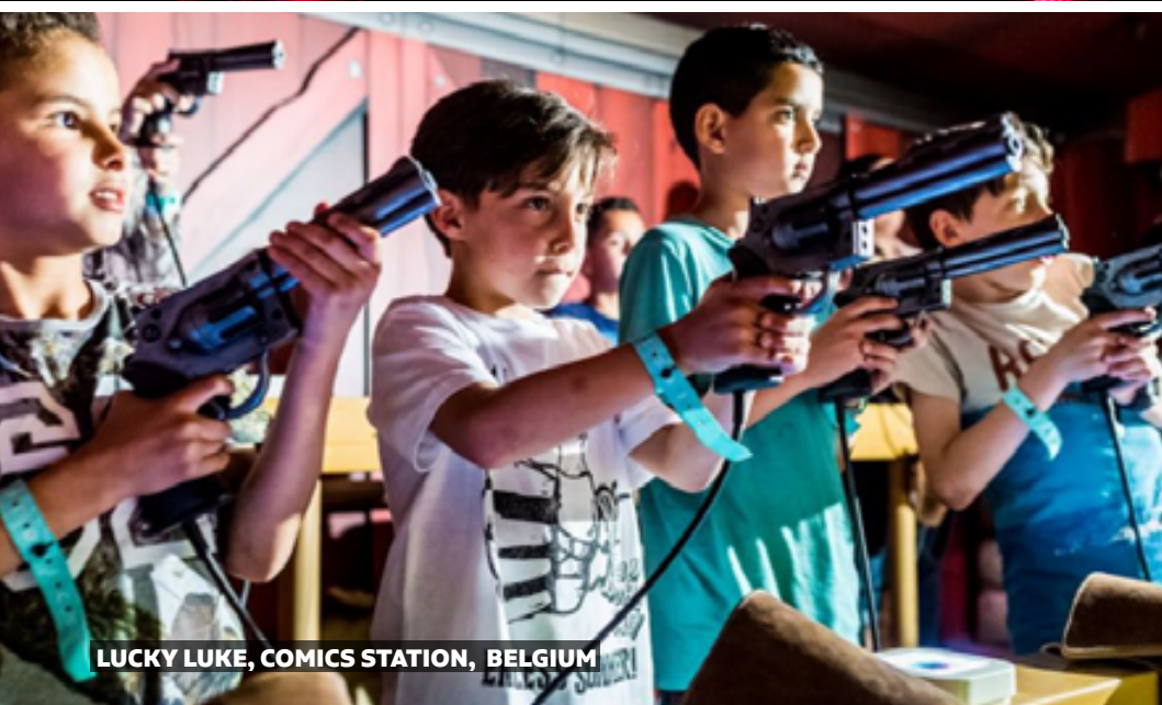
LUCKY LUKE, COMICS STATION, BELGIUM