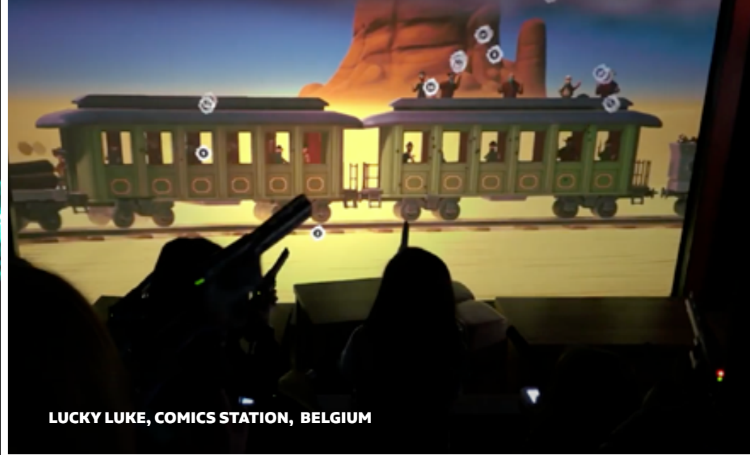
LUCKY LUKE, COMICS STATION, BELGIUM