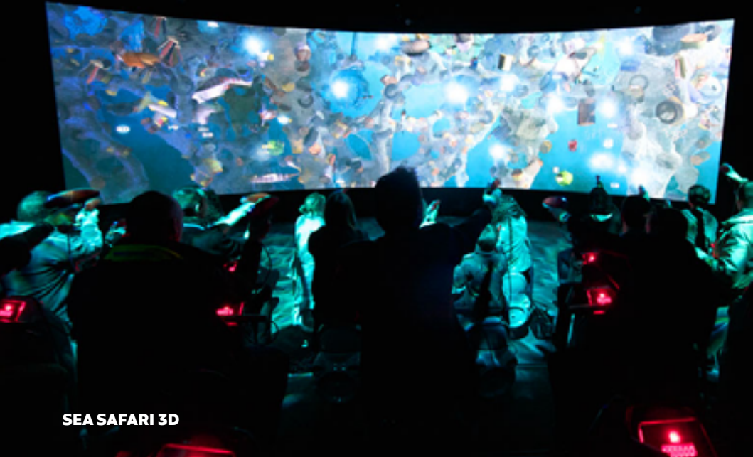
SEA SAFARI 3D