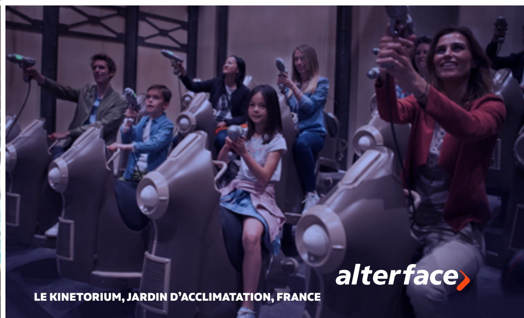
LE KINETORIUM, JARDIN D'ACCLIMATATION, FRANCE